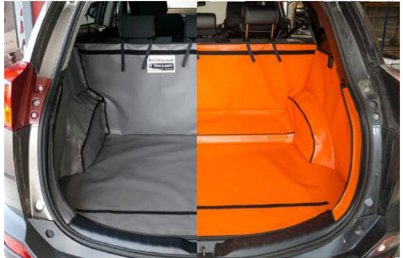
Left: Non Hybrid Rear Plus version