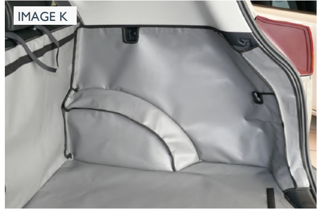
Non hybrid Rear Plus cargo liner prepared for a Bumper flap and a Seat Flap