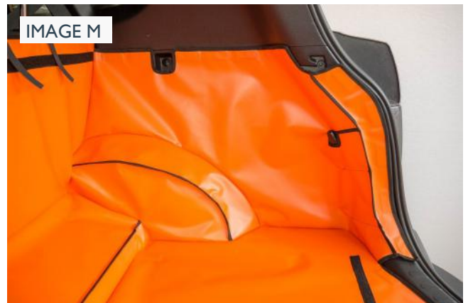
Hybrid Standard cargo liner prepared for a Bumper flap and a Seat Flap