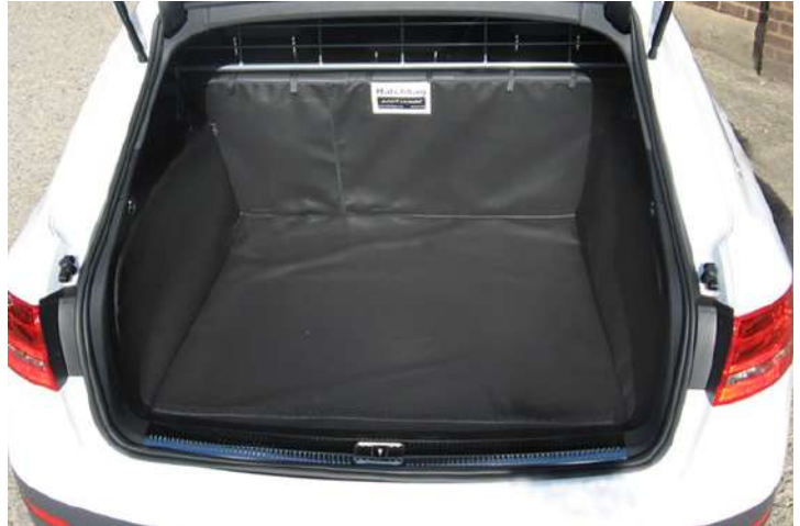
Rear plus cargo liner with seat split version